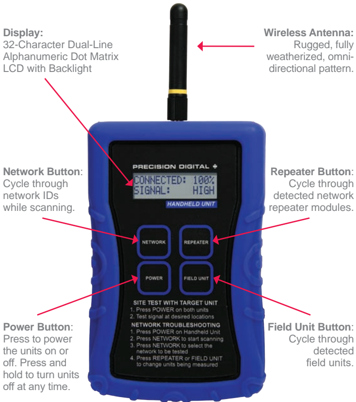
▲ PDA10 Handheld Unit Shown

The four buttons on the face of the handheld unit make it simple to power on the unit and start testing your devices for wireless signals. Cycle through any of your network to test field units and repeaters for strong wireless signals.