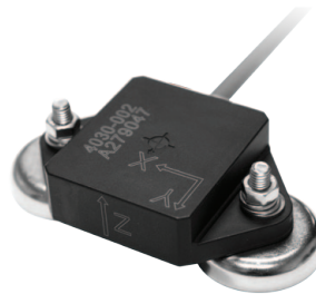
Accelerometer with magnetic mounting hardware included.